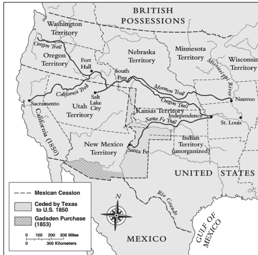
WESTWARD EXPANSION AND PIONEER TRAILS, 1840s

Prelude to Civil War? By increasing tensions between the North and the South, did the war to acquire territories from Mexico lead inevitably to the American Civil War? Without question, the acquisition of vast western lands did renew the sectional debate over the extension of slavery. Many Northerners viewed the war with Mexico as part of a Southern plot to extend the “slave power.” Some historians see the Wilmot Proviso as the first round in an escalating political conflict that led ultimately to civil war.